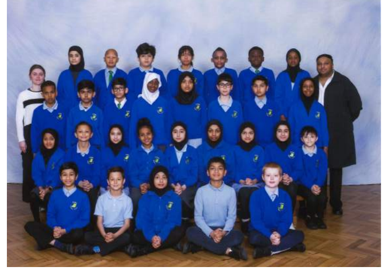
Your Argyle Adventure has ended. Use all the skills you have learnt here and build on them in your new school. Make the most of the next chapter!

To our year 6 pupils, we wish you a smooth transition to secondary school. Always remember to try your best, believe in yourself, show kindness, take care of yourself, others and your environment, have a go at new things and be resilient.